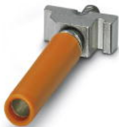
Female test connector, With slide, Color: orange

Please be informed that the data shown in this PDF Document is generated from our Online Catalog. Please find the complete data in the user's documentation. Our General Terms of Use for Downloads are valid ( http://phoenixcontact.com/download )