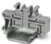
Quick mounting end clamp for NS 35/7,5 DIN rail or NS 35/15 DIN rail, with marking option, width: 9.5 mm, color: gray