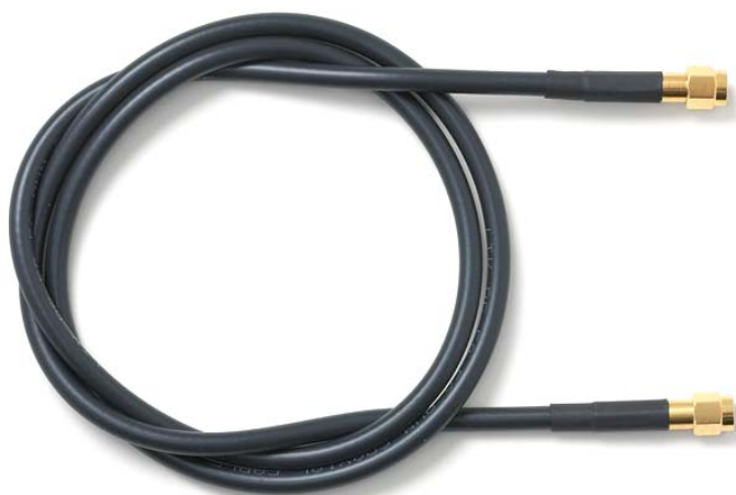
Model 4846-C SMA Plug to SMA Plug, RG58C/U

Small size, and durability for confident connections