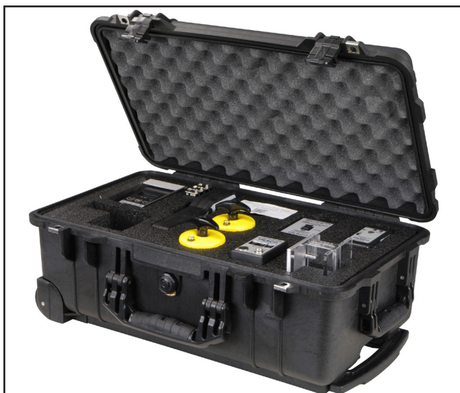
Figure 2. Desco 50569 ESD Survey Kit, Asia, 220VAC