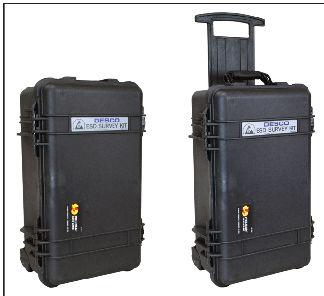
Figure 3. Extendable handle on the carrying case