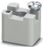
Support bracket made from insulation material, with retaining screw, can be used with either 3 x 10 mm or 6 x 6 mm busbar, color: gray