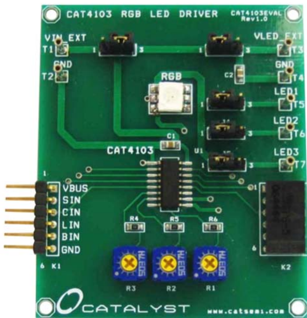
Figure 1. CAT4103AGEVB Board

The CAT4103 is a three channel constant-current LED driver for RGB LEDs. Individual current settings are set by connecting a single resistor from each RSET pin to GND. A four-wire serial interface and output data pins allow for programming one or multiple CAT4103 devices cascaded together. Additional details and electrical characteristics can be found in the CAT4103 data sheet.