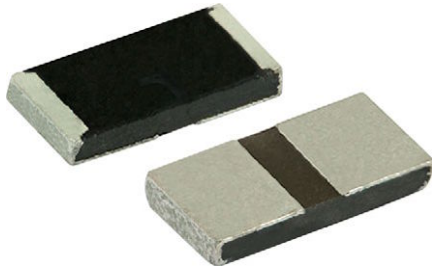
Aluminum nitride over 3 x more power - same size