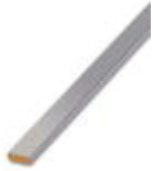
PEN conductor busbar, 3mm x 10 mm, length: 1000 mm

Neutral busbar - NLS-CU 3/10 SN 1000MM - 0402174