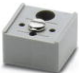
Support bracket, for insulated mounting of DIN rails in insulated systems, plastic, 21 mm high