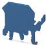
Support bracket, Number of positions: 1, Width: 2 mm, Color: blue