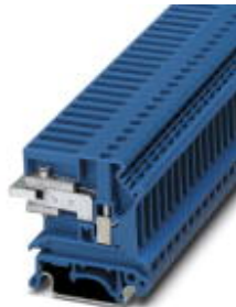
N disconnect terminal block, Screw connection, Cross section: 0.2 mm 2 - 6 mm 2 , AWG: 24 - 10, Width: 6.2 mm, Color: black, Mounting type: NS 35/7,5, NS 35/15, NS 32

Please be informed that the data shown in this PDF Document is generated from our Online Catalog. Please find the complete data in the user's documentation. Our General Terms of Use for Downloads are valid ( http://phoenixcontact.com/download )