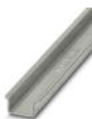
DIN rail, material: Steel, unperforated, 2.3 mm thick, height 15 mm, width 35 mm, length: 2 m

DIN rail, unperforated - NS 35/15-2,3 UNPERF 2000MM - 1201798